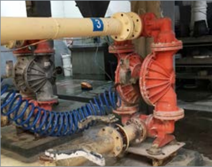
Wilden Chem-Fuse IPDs provide a reliable, efficient and safe solution for improved diaphragm performance, even in the harshest fluid-transfer applications.