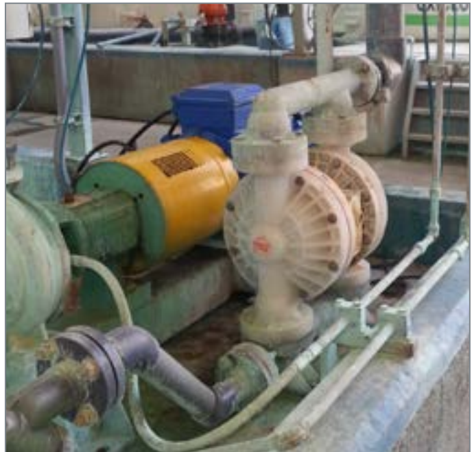
Traditional diaphragm designs feature inner and outer plates that connect the diaphragms to the pump shaft. While this design does have its operational benefits, there are some shortcomings that can lead to the creation of leak points that can affect product containment, which is especially critical when handling dangerous or hazardous materials.

Taking into account the problems that abrasion wear and material buildup can cause, the industry worked diligently to develop the integral piston diaphragm, or IPD. Within the IPD design, the piston that is used to move the diaphragm laterally during the pumping stroke is encapsulated into the interior of the diaphragm itself. IPDs also have a smooth finish with an angle of operation that enhances fluid flow and suction lift while reducing the propensity for material buildup on the outer piston.