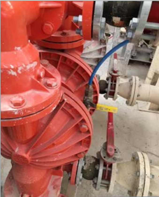
Improved diaphragm design was the next frontier in the further optimization of AODD pump performance and the integral piston diaphragm (IPD) helps realize improved diaphragm operation.

Over the years, it had become apparent to leading AODD manufacturers that improved diaphragm design was the next frontier in relation to better, more reliable pump performance. Driven by the belief that a better diaphragm could be developed, diaphragm manufacturers have discovered better ways to build diaphragms and make it easier to satisfy their operational demands.